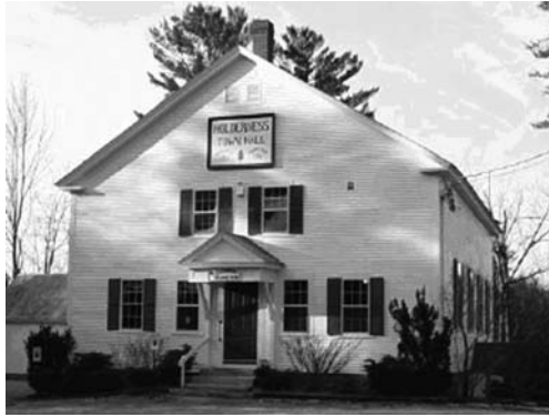
Holderness Town Hall

Established in 2007 to recommend to the Board of Selectmen steps town government can take to save energy and reduce emissions, the Holderness Energy Committee (HEC) met several times to discuss a number of energy related topics and to implement plans reduce energy usage by town government.