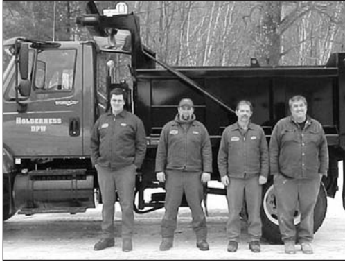
Holderness Highway Personnel