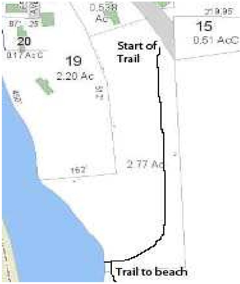
Figure 3. The Pemigewasset Riverside Park