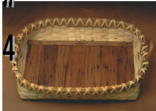
#1 Roll Basket