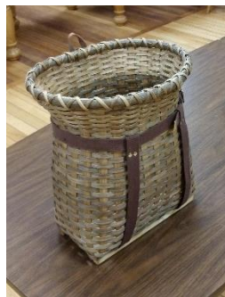
Door basket: $135

base 3.5" x 3.5" by 10: High Leather strap or cotton strap.