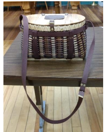
Mushroom: $165 – 2 DAY