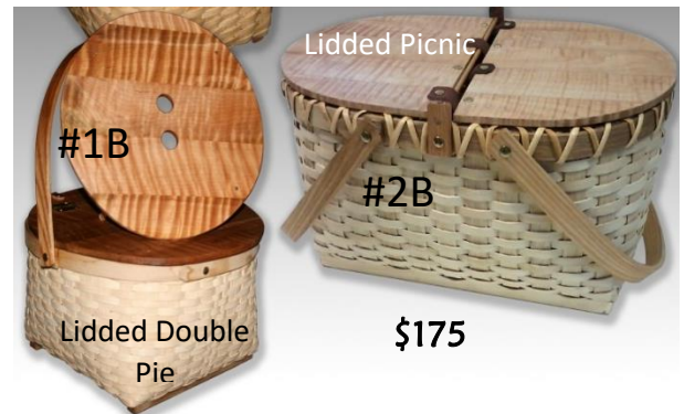
#2B Lidded Picnic Basket 9" Wide x 15" Long x 8" High

*Leather hinges and wood swing handles will be on the picnic basket* Lids offered will be in cherry, walnut or tiger maple. *Double pie and picnic baskets will have brass hinges and leather straps for the lid with wooden swing handles*