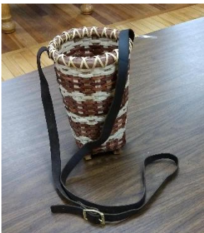
Blueberry Basket: $100

*Leather hinges and wood swing handles will be on the picnic basket* Lids offered will be in cherry, walnut or tiger maple. *Double pie and picnic baskets will have brass hinges and leather straps for the lid with wooden swing handles*